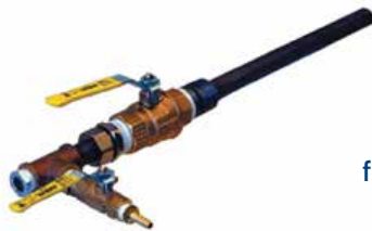
PN 20263 Coated sample tube for non-catalytic reaction

По вопросам продаж и поддержки обращайтесь: